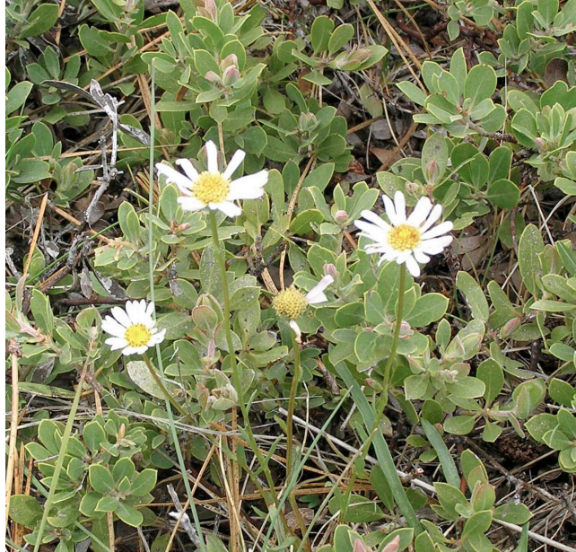
Erigeron stanselliae , growing up through a mat of Arctostaphylos nevadensis . From the type locality in Curry County.