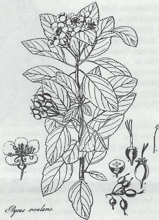
An 1833 drawing of Malus fusca (then called Pyrus rivularis ) from Flora Borealis-Americana or The Botany of the Northern Parts of British America , by William Jackson Hooker, LL.D, F.R.A., and L.S. This drawing was done from a collection by David Douglas who saw it " ... on the banks of streams near the ocean, from the mouth of the Columbia northwards." Hooker notes that the Chinook Indians called the edible fruits Pow-itch.