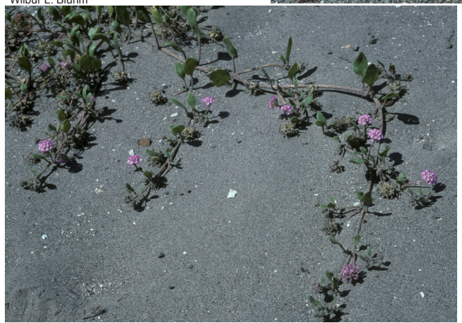
best survey times J|F|M|A|M|J|J|A|S|O|N|D