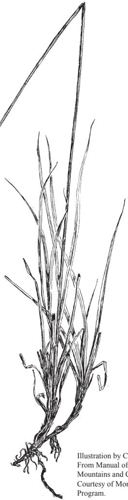
Illustration by Charles Feddema. From Manual of the Carices of the Rocky Mountains and Colorado Basin.

Stems 20-35 cm in clumps from short rhizomes. Leaf blades flat, 3-20 cm long and 2-4 mm wide, crowded at the base, old leaves conspicuous. Inflorescence clustered in usually 3 spikes, often all pistillate, uppermost larger than others, male flowers absent or scattered, the spikes form a narrow, interrupted head with small sheathless bracts at the top of the stems; scales are at least twice as long as the perigynia, brown with translucent margins and lighter center; perigynia numerous, yellow-green and glabrous, with a short beak. Fruit is a triangular achene with concave sides.