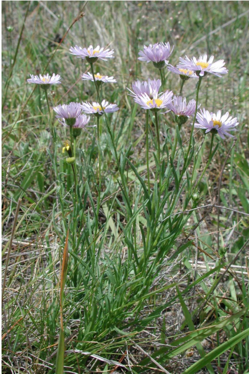
Institute of Applied Ecology

Asteraceae Pacific fleabane, Willamette Valley daisy